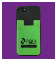
Cell Phone Wallet

Your prize will be sent to you by return mail.